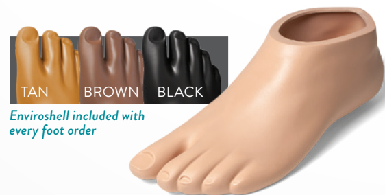
Enviroshell included with every foot order

** (C)aucasian, (T)an, (B)rown, or (J)et Black.